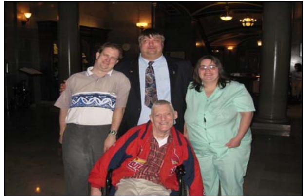
Self-advocates and members of People First of Missouri from St. Louis, Rolla, Marshall, and Springfield, MO in Jefferson City, MO. These self-advocates represent a diversity of employment & independent living situations.