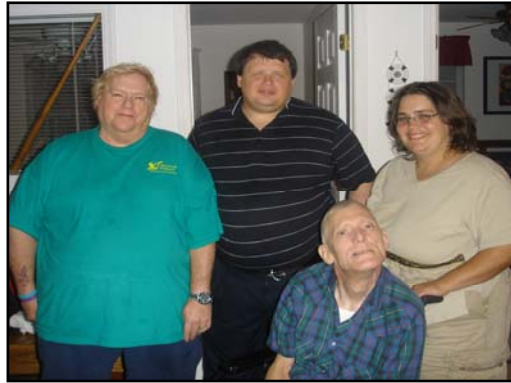
Statewide Officers of People First of Missouri use alternatives to guardianship for support, including, but not limited to support from their church, family, and friends in the community.

There are ways other than guardianship to provide support and protection for an individual, and to establish decision making supports in certain areas, such as health care and finances.