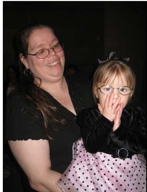
A self-advocate and Statewide Officer of People First of Missouri, who is married with children, enjoys a little play time with her daughter