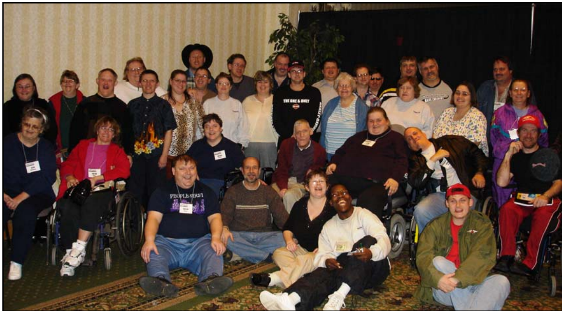
Members of People First of Missouri's Statewide Steering Committee represent a diversity of cultures situations, needs and available supports. The committee meets quarterly to learn about best practices.

Sometimes, even when a parent or loved one would otherwise choose an alternative to guardianship for support and protection of an individual, there are circumstances where in order to protect a person's rights, they will choose a guardianship option to make sure that continuing care is provided for that individual by having the legal authority that is being required by a particular service provider or system. However, it is important to remember that guardianships can be very difficult to modify or terminate.