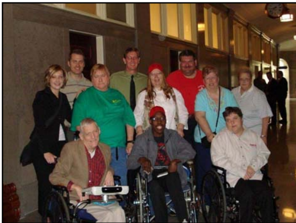
Members of People First of Missouri, supporters, and advocates at the Capitol in Jefferson City, MO during their yearly meeting on Disability Advocacy Day.

Keeping in mind that the freedom to make decisions defines all of us as human beings and plays an important part in determining our quality of life, ask yourself, “What kinds of decisions do I make every day that I value the freedom to make for myself?”